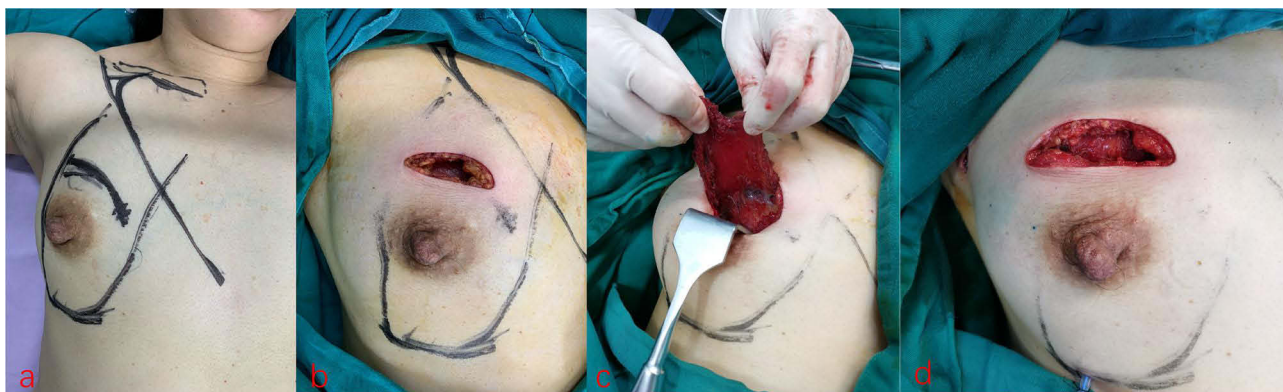
Figure 1 Conditions for oncoplastic surgery. (a) curving skin incision and positions of patients; (b) tumor margins for oncologic safety; (c) the detection of thoracic-acromion pedicle; (d) the myofascial flap after folded.

All patients received the standard protocols for systemic therapy. All of them received radiotherapy after surgery. And they were followed up regularly for oncological safety and cosmetic results from multiple dimensions such as post-operative appearance, feel, cup size changes, and quality of life.