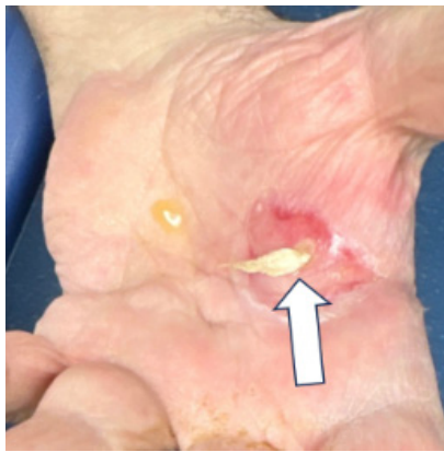
Image 1. Photo of patient's left hand with spontaneous tendon rupture (arrow) present as well as serosanguinous fluid present.

He was diagnosed with acute limb ischemia suspected to be secondary to an acute arterial occlusion, as well as spontaneous flexor tendon rupture secondary to an abscess within the