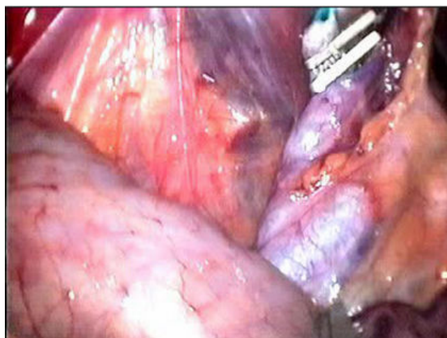
Figure 2 The visualisation of cystic duct and ductus choledochus with methylene blue after removal of gall bladder.

Bile duct injuries are associated with significant morbidity, prolonged hospitalization, increased financial burden, potential litigation and occasional mortality [1,5,6,10,11]. It is the third most commonly litigated general surgical complication in The United States and it has been also reported that on the average two procedures (between 1 to 8) are required for definitive repair of bile ducts [5]. Obviously, if bile duct injury is noticed preoperatively and repaired in the best way, morbidity and mortality rates would be significantly reduced.