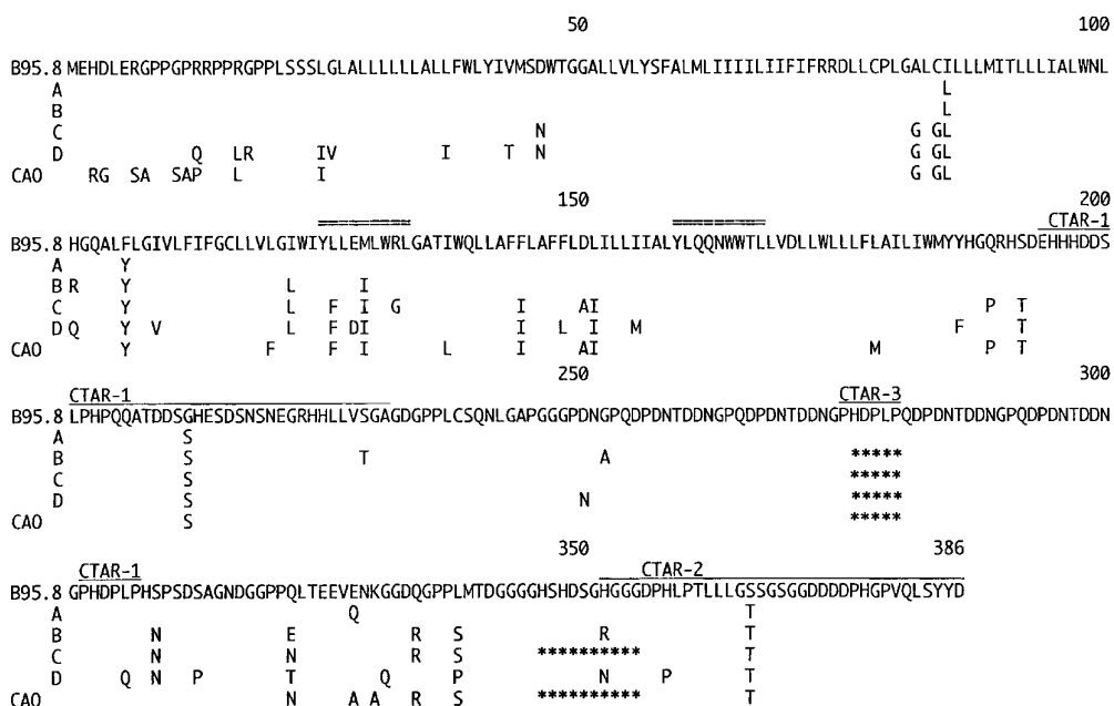
Figure 3 The amino acid sequence of the B95.8 latent membrane protein 1 (LMP-1) is shown in full. 11 For our group A–D variants and CAO-LMP-1 only mutated amino acids are shown. 15 The CAO-LMP-1 gene contains seven 11 amino acid repeats and our group B/C isolates contained from three to seven 11 amino acid repeats in the repeat region. In this figure only four are shown. Amino acid substitutions in the transmembrane domain suggested by Müller and colleagues 29 to increase NF- \kappa B activation are at positions 86, 106, 122, 128, and 129. The HLA-A2 restricted cytotoxic T cell epitopes are marked with a double line: the cytotoxic T cell epitope eliciting a strong response at amino acids 125 to 133 and the cytotoxic T-cell epitope eliciting a weak response at amino acids 159 to 167. 30 The C-terminal activation regions 1 (CTAR-1) and CTAR-2, and the recently identified CTAR-3, are indicated by a single line. 35–40 The five amino acid (15 bp) deletion in the repeat region and the 10 amino acid (30 bp) deletion in the C-terminus are marked by asterisks.

not shown). One infectious mononucleosis (IMc8) and three Hodgkin's disease isolates showed group B mutations in the sequenced parts. The infectious mononucleosis case (IMc8) contained four additional unique mutations in the C-terminus (168318, G \rightarrow C; 168317, G \rightarrow A; 168278, G \rightarrow A; 168277, A \rightarrow C). One Hodgkin's disease isolate (HDc48) contained an intermediate pattern of single base mutations including three of the group B mutations (positions 168992, 168957, and 168687), one of the group C/D mutations (position 168943; L126 \rightarrow F), and two unique mutations (T \rightarrow C at position 168814 and G \rightarrow C at position 168661).