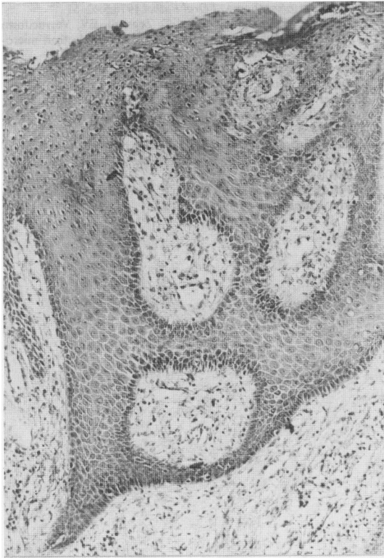
Fig 2 Clusters of foam cells in papillary dermis between rete pegs (periodic acid Schiff).