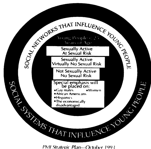
Figure 2 Prevention marketing for HIV/AIDS identified and analysed target audiences, as illustrated in this chart from the Centers for Disease Control and Prevention (CDC) Prevention Marketing Initiative (PMI) Strategic Plan (October 1993).