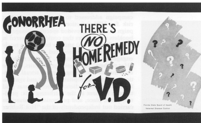
Figure 1 VD education in the 1960s emphasised signs and sequelae to encourage people to seek proper medical care, as illustrated in this pamphlet from the Florida State Board of Health (1961).

Strategies for STD prevention in the 1990s are characterised by the identification of behaviours involved in STD transmission, analysis of the determinants of those behaviours in various social groups, and the development, testing, and evaluation of social and behavioural interventions to induce and maintain behaviour change. The goal of STD prevention programmes is not to change the behaviour of everyone, but to modify the behaviours of those most likely to contract and spread STDs. 23 Tools for accomplishing behavioural objectives include social marketing, community as well as individual level interventions, and theoretically guided approaches to behaviour change.