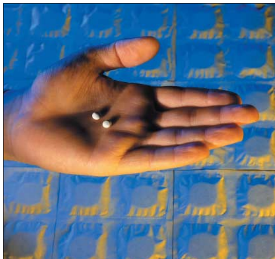
Participants in open label extension studies need more information

The clinical picture of some participants may also have changed during the phase III trial. Participants may no longer meet the inclusion criteria or may no longer require treatment. At the conclusion of a trial participants are normally reviewed by their doctor. Enrolment in an extension study could result in