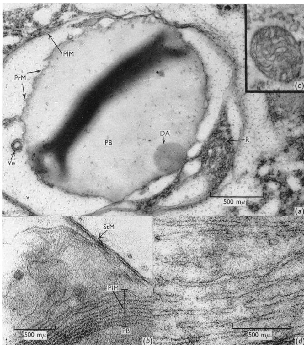
Electron micrographs of structures observed in intact endosperm of wheat grain. (a) Portion of endosperm of T. durum cultivar. Dural at about day 19 after flowering; the tissue was fixed with formaldehyde and the section was treated with lead hydroxide. (b) and (c) Different areas of sections of T. vulgare cultivar. Kashmir no. 5 at about day 22 after flowering; the tissue was fixed with formaldehyde and subsequently treated with potassium permanganate. (d) Area of a section of T. vulgare cultivar. Insignia at about day 16 after flowering; the tissue was fixed with osmium tetroxide. PB, Electron-dense protein body; PrM, membrane of protein body; PIM, outer membrane of plastid; R, electron-dense particles; v, area of low electron density, possibly a vacuole between protein body and outer membrane; Ve, vesicles; DA, spherical area of uniform electron density within the protein body; StM, double membrane enclosing starch grain.