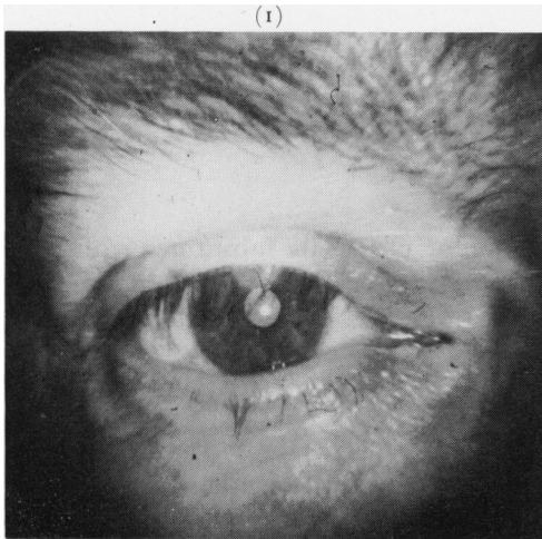
FIG. 1 Case 1. Right eye

Case 3, a 52-year-old woman, presented in December, 1969, with swelling of the eyelids for the past 16 months. On questioning she admitted feeling very cold, weak and tired. She was a typist and her fingers used to get so tired that she was unable to work. Her mother had myxoedema.