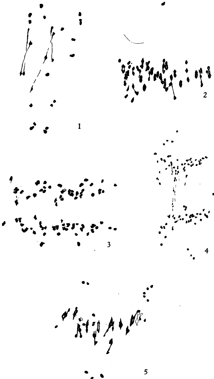
FIGURE 1.—First meiotic anaphase of haploid (AD)_1 plant of G. hirsutum showing four bridges.