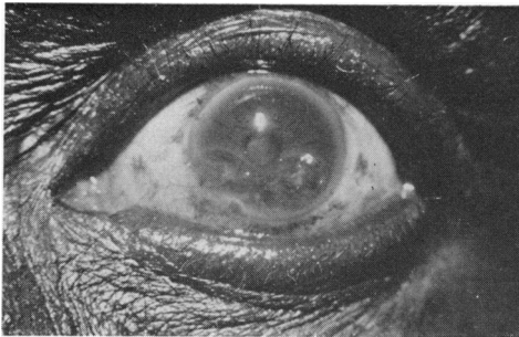
FIG. 1 Small oil droplets spread diffusely over lower half of cornea

(2) The second stage was characterized by a diffuse spread across the cornea in the interpalpebral region. Seen macroscopically, the involved parts presented as a hazy area of cornea interfering with a clear view of the fundus (Fig. 1). The "oil droplets" varied in size; some were large, and the beginning of extension into the deeper parts of the corneal epithelium was seen. The cornea was non-vascularized and not painful. The only subjective complaint was diminished visual acuity.