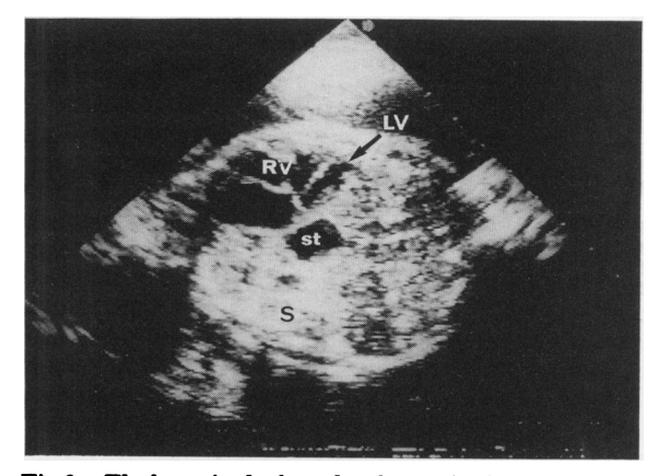
Fig 2 The heart in the four chamber projection showing the relative hypoplasia of the left ventricle (LV) that is caused by the stomach and bowel occupying the whole of the left thorax. The heart lies in the right chest. s, spine; st, stomach; RV, right ventricle.

Our results show that it is possible to recognise coarctation of the aorta as early as 18 weeks' gestation. Recognition depends on integrating many features. These include analysis of the relative sizes of the two ventricles and great arteries and the evaluation of the aortic arch in fetal life. The right ventricle is normally slightly larger than the left and the pulmonary artery slightly larger than the aorta.<sup>4</sup> If these features are more pronounced than normal coarctation should be suspected. In the past the evaluation of the arch and isthmus relative to the arterial duct and pulmonary arteries was subjective. Recent measurements of these structures in the normal fetus will allow us to be more objective in