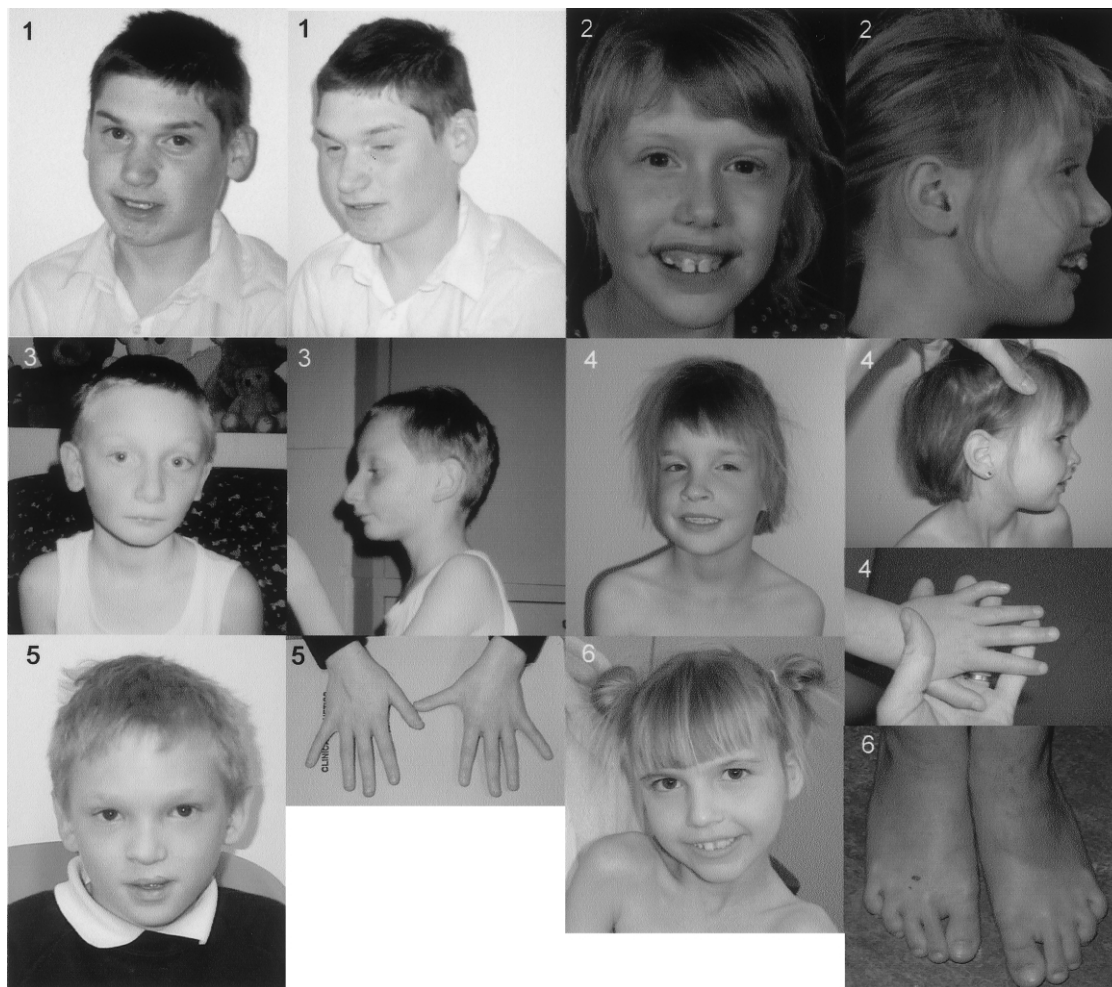
Figure 1 Photographs of patient 1, at age 9 years, 11 mo; patient 2, at age 14 years; patient 3, at age 6 years, 7 mo; patient 4, at age 6 years; patient 5, at age 7 years, 11 mo; and patient 6, at age 8 years, 10 mo. Written consent to publish these photographs was obtained from the parents of each child.

SmartCapture 2 software (Digital Scientific). Published STS primers STS-R44803, SHGC-170324, D3S4248, SHGC-34823, SHGC-149375, SHGC-10638, RH45269, SHGC-146015, RH99161, D3S2320, and RH80465 were used to check the identity of the clones (fig. 2B). In patients 1–4 and patient 6, the deletion endpoints were refined to within a single BAC clone. The telomeric breakpoint was within BAC clones RP11-594G13 and RP11-496H1, and the centromeric breakpoint was within BAC clones RP11-185G19 and RP11-480A16. For patient 5, there was insufficient material available to define the centromeric breakpoint, but the telomeric breakpoint was within BAC clone RP11-496H1, as for patient 2. The centromeric breakpoint lay between BAC clones RP11-171N2 and RP11-185G19 (table 2). At the telomeric breakpoint, the two BAC clones that define the deletion endpoint in the six patients overlap, and both contain STSs RH45269 and SHGC-146015. Most of clone RP11-594G13 is also contained within RP11-496H1, but clone