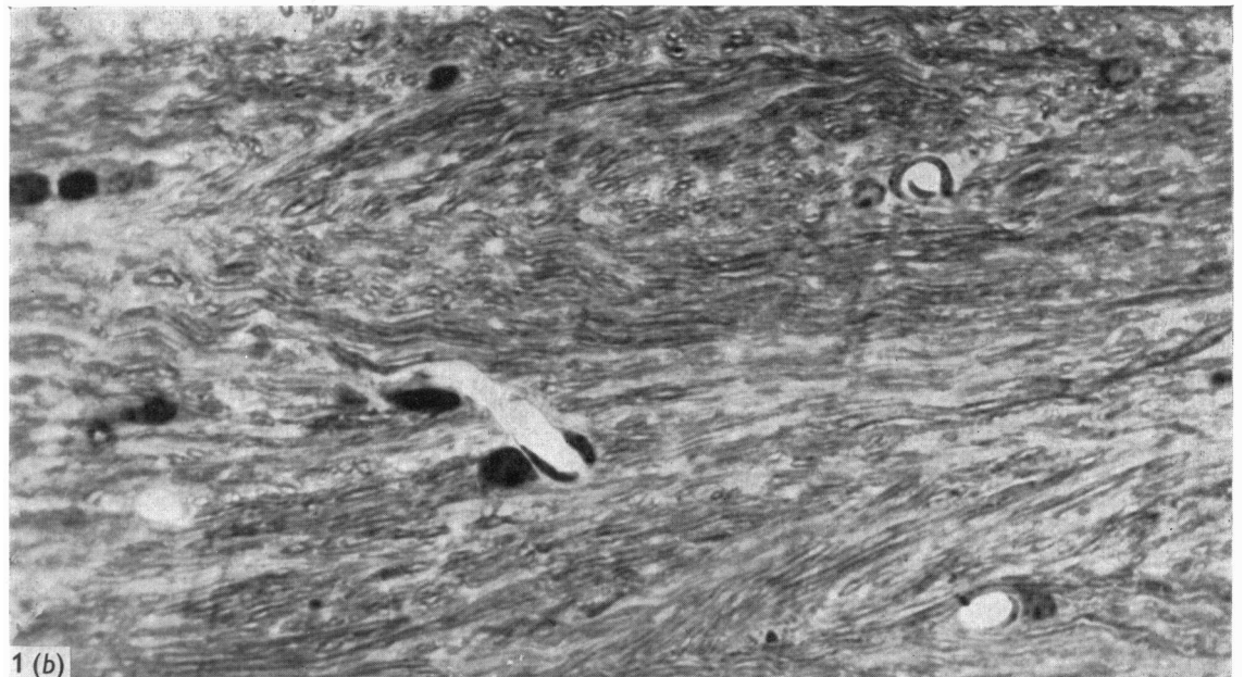
Fig. 1. (a) Crushed preparation of the anterior limb of the anterior commissure showing the rope-like entwining of the fibre bundles. \times 125 .