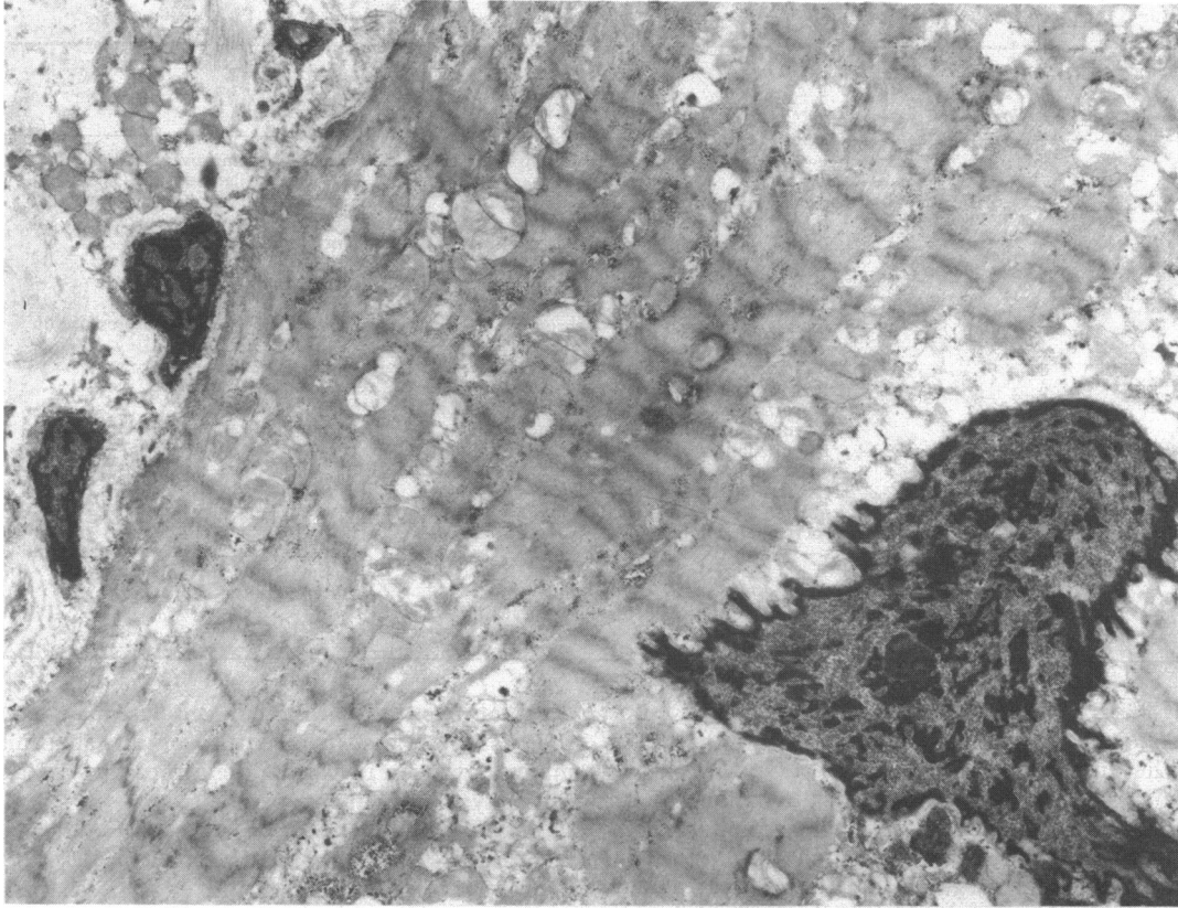
Fig 3 Electronmicrograph showing regular alignment of myocardial fibrils. In the interstitial space, lymphocytes and bundles of collagen can be identified. These changes indicate that the healing phase of myocarditis has been reached. Lead citrate and uranyl acetate.

but the presence of conspicuous chronic inflammatory cells, even on a first biopsy specimen, suggests the possibility of a previous myocarditis. Sampling errors may be a problem because of the small size of the samples obtained by bioptome. It has, however, been shown that if five or more biopsy specimens are taken from a ventricle, then these specimens probably accurately reflect the rest of the myocardium, 16 although the Dallas panel recommends a minimum of three specimens, as were obtained in this study; therefore the presence of focal myocarditis in the "non-myocarditic" group remains a possibility.