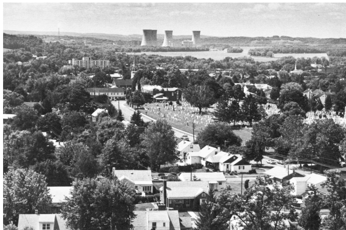
Figure 1. View of TMI from the roof of an apartment building in Middletown, Pennsylvania, 19 July 1979.

In the spring of 1984, Marjorie Aamodt initiated a household survey in three hilltop communities with a total population of about 450 people. All three neighborhoods had unobstructed views of TMI at distances of between 3 and 8 miles (Aamodt and Aamodt 1984). Two of the communities were areas