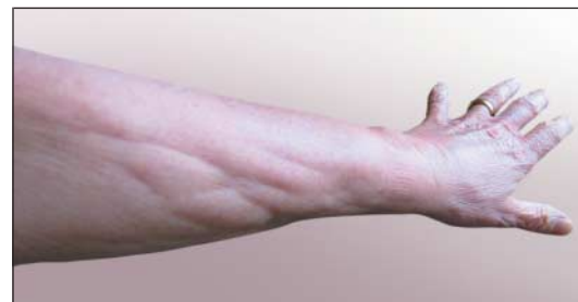
Left arm of the first woman showing puckering of the skin due to a sclerosed network of forearm veins

This complication had not previously been reported to the Committee on Safety of Medicines or the drug company, although the serious effects of extravasation of