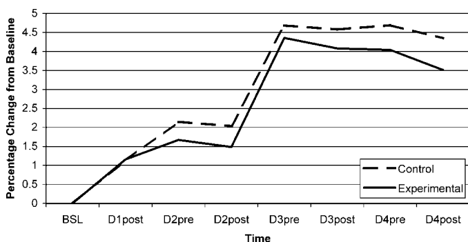
Figure 2. Pain ratings for control and experimental groups. Pain data were collected 7 times after baseline and were significantly higher than baseline (0) throughout the experiment. BSL indicates baseline; D1post, day 1, postexercise; D2pre, day 2, pre-exercise, etc.

†Statistically significant at P < .01 (Bonferroni correction = 0.05/5 comparisons).