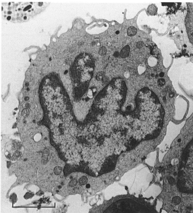
Fig. 1. Monocyte from Day 0 specimen. The surface shows short microvillous projections and numerous pinocytotic vesicles. Characteristic lysosomal granules and mitochondria are evident in the cytoplasm. The nucleus is irregularly shaped, showing two profiles and the heterochromatin is peripherally distributed. Bar, 2 \mu\text{m} .

were V_C , V_N and V_M : S_C , S_N and S_M : excess membrane for cell and nucleus: and the number of mitochondrial profiles per section. These parameters were selected as variables independent of one another, the specific aim being to minimise or eliminate the effects of colinearity between variables. An example of such colinearity would be a reduction in the nuclear volume fraction when cell size increased independently of nuclear changes.