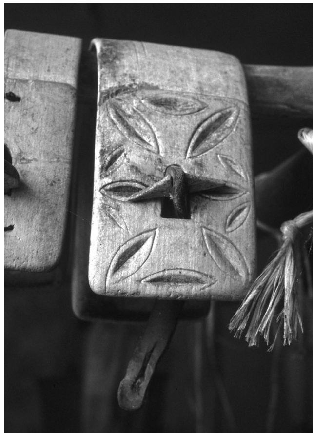
Figure 4 Decorations on a "puntagliera", special collar made with Acer sp. for goats and cows (various species of this genus are used to do such collars).

Another occupation that was once important but that has disappeared entirely today is charcoal production. Large amounts of firewood (up to 20 3 ), were piled up to form cones about 2 m high and then covered first with Ampelodesmos or Sambucus ebulus leaves, and then with a layer of about 10 cm of earth, after which the fire was lit through an opening at the base. Combustion lasted for