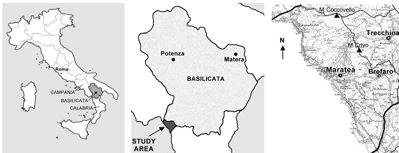
Figure 1 Geographical location of the field research area in the Basilicata region, Italy.

urban impact upon the area of study, considered a good source of information for ethnobotanical applications typical in the central Mediterranean area.