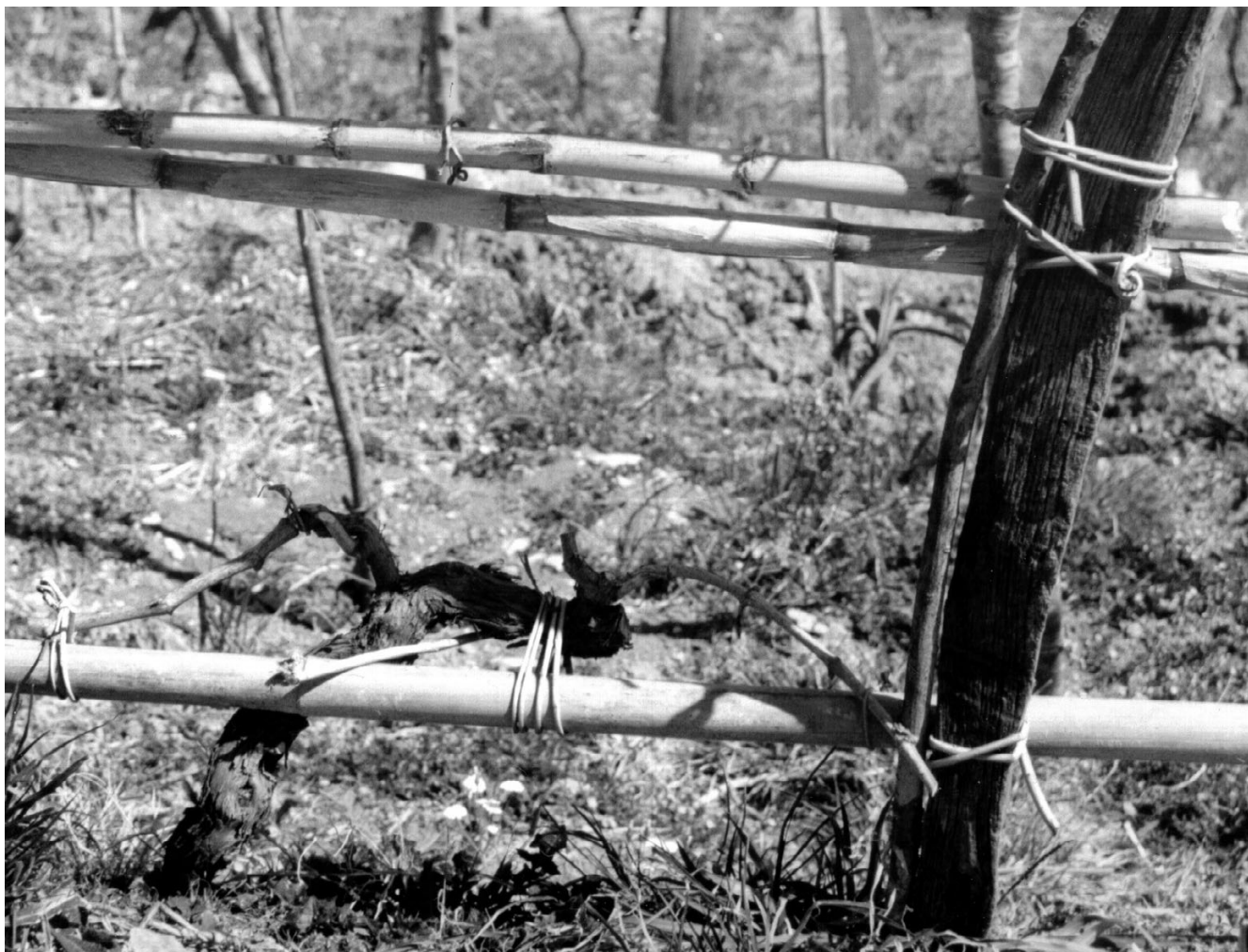
Figure 3 Vine tied with Salix alba subsp. vitellina branches.