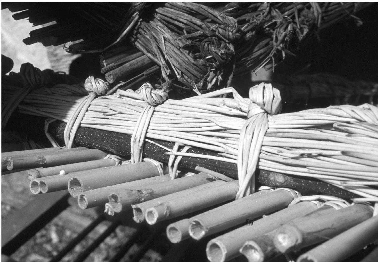
Figure 6 Rack ("gratedda"), tray made with Arundo donax and edge of Spartium junceum , used for drying foodstuffs.

americana . The tough terminal prickle of the leaves and the tenacious fibres connected to it, removed together, were utilized as needle and thread for mending or sewing more or less unrefined fabrics. An analogous use is cited by Parada et al. [24]. "Spartu" ( Spartium junceum ) was, instead, also used for making clothes, in addition to flax. The fibre was extracted by beating and then washing small bunches of the previously boiled flexible stems (for fibre extraction see also Musacchio and Barone Lumaga [25]). This activity was carried out in the territory under study by a few families, while in other areas of southern Italy [26], and above all in Calabria, it appears to have flourished notably during the 1930s in the fascist period. During this era an autocratic economy producing food and clothes (e.g. with Spartium junceum fibers) without foreign imports existed in Italy. With the inflorescences of A. donax and Arundo pliniana particularly good brooms were made. Another type of small broom used after threshing to separate the grain of Triticum aestivum from the bran