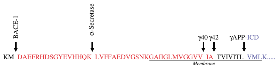
Figure 2 Cleavage sites of \alpha -, \beta -, and \gamma -secretase. The A \beta domain is shown in red, the TMD is underlined, and the APP-ICD is shown in blue.

(Figure 2), which cleaves APP in the middle of the A \beta domain at amino acids 19 and 20 (Farzan et al , 2000). Thus, BACE-2 does not contribute to the amyloidogenic processing of APP, which is consistent with the complete lack of A \beta generation in a BACE-1 knockout.