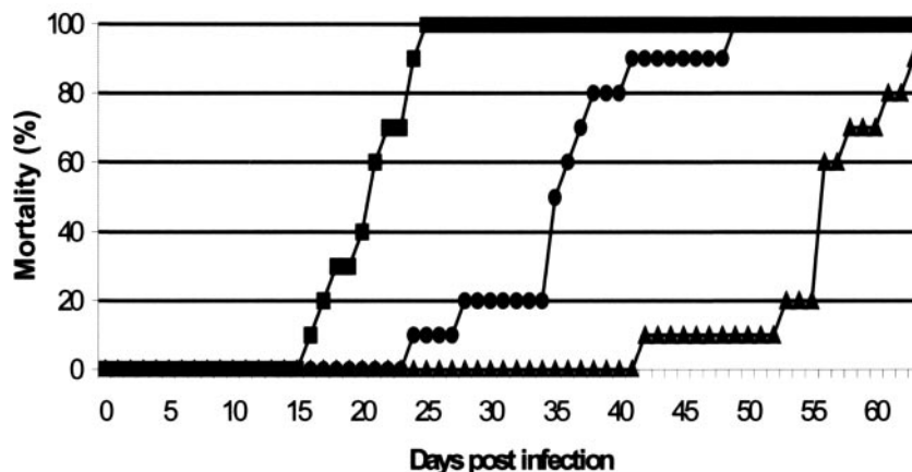
FIG. 2. Effect of IDU or HPMPC on VV-induced mortality in intranasally infected SCID mice. Data are mean values from two independent experiments. IDU was administered subcutaneously at 150 mg/kg/day from day 0 to 4 and at 75 mg/kg/day from day 7 to 11, and HPMPC was administered at 25 mg/kg/day from day 0 to 4 and from day 7 to 11. Symbols: ■, untreated controls (n = 10); ●, IDU-treated mice (n = 10); ▲, HPMPC-treated mice (n = 9).

apy. Lower doses of drugs that still proved antivirally active (Fig. 2; Tables 1 and 2) were well tolerated and resulted in a less-pronounced growth retardation.