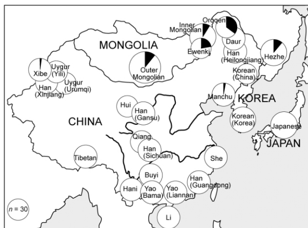
Figure 3 Geographical distribution of Manchu cluster chromosomes. Circles , Populations sampled, with area proportional to sample size. Filled sectors , Manchu clusters.

maintained many concubines. A central part of the Qing social system was the army, the Eight Banners, which was made up of separate Manchu, Mongolian, and Chinese (Han) Eight Banners. The nobility occupied high ranks in the Manchu Eight Banners but not in the Mongolian or Chinese Eight Banners; the Manchu Eight Banners were recruited from the Manchu, Mongolian, Daur, Oroqen, Ewenki, Xibe, and a few other populations. A social mechanism was thus established that would have led to the increase of the specific Y lineage carried by Giocangga and Nurhaci and to its spread into a limited number of populations. We suggest that this lineage was the Manchu lineage.