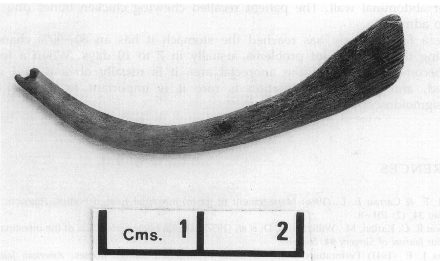
Fig. 2 4 cm bone fragment.