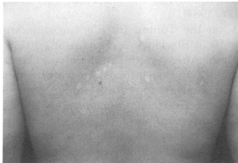
Fig. 3. Photograph of the healed lesions 3 weeks after initial presentation on the back of the patient described. A central area of pigmentation surrounded by an area of depigmentation is seen for each lesion.