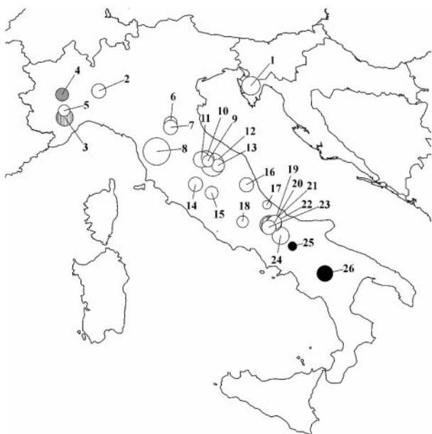
FIG. 2. Sampling localities and geographic distribution of genetic variability. Numbers refer to populations listed in Table 1. Diameters of the circles are proportional to the sample sizes. Differently shaded circles show genetically different population groups according to SAMOVA based on R_{ST} index and a K of 4.

tion decreased slightly, because some truffles probably originated from the same vegetative mycelium. For example, of the nine ascocarps harvested in Certaldo, only three haplotypes were found. However, from the 16 and 10 ascocarps from Ascoli and Pietralunga, 10 and 7 haplotypes were identified, respectively.