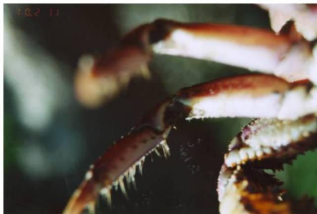
Figure 5 Legs of Ucides cordatus females virtually without hairs (Photo: Guy Nishida).

The correlation analysis showed that the crab morphometric values of length and width, as well as burrow opening dimensions were the main variables which had a significant association. The following conclusions can be reached from our results: carapace height was weakly correlated with burrow opening height ( r = 0.37 ) and with burrow opening width ( r = 0.40 ), probably because U. cordatus individuals enter the burrow by flexing their chelipeds frontally to the body, in a way that the longest axis of the burrow opening (its height) corresponds to the carapace height (Figure 3). This lateral movement of young