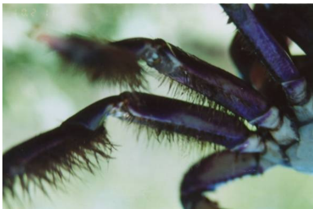
Figure 6 Hairy legs of Ucides cordatus males (Photo: Guy Nishida).

obtained from gatherers. Marques [45] also reported the gathering of relevant local information on the diet of an estuarine fish ( Arius herzbergii , Ariidae).