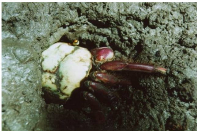
Figure 4 Ucides cordatus specimen entering the burrow.

5), and leave thin deep tracks at the burrow entrance, in opposition to the hairy legs of males (Fig. 6), leaving relatively wide and shallow tracks. Figure 7 shows a land-crab gatherer during harvesting activities.