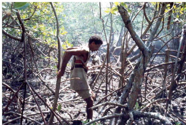
Figure 7 Gatherer of the land crab 'caranguejo uçá' ( Ucides cordatus ) in the mangrove habitat the River Mamanguape estuary.

In the State of Paraíba the law prohibits that females of any size and males smaller than 4.5 cm of carapace length be captured. We believe that the re-examination of the existing laws of crab harvesting and other crustaceans are urgently needed for the preservation of natural stocks of these animals. The gatherer's environmental perception and its consequent influence on capture efficiency, are the main factors to be considered when making decisions