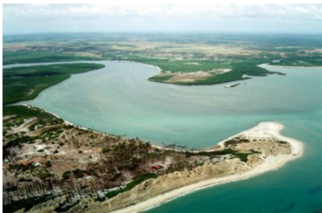
Figure 2 Aerial view of River Mamanguape estuary.

traditional human populations, of which nearly 80% were published over the last 20 years, and mainly in the last decade.