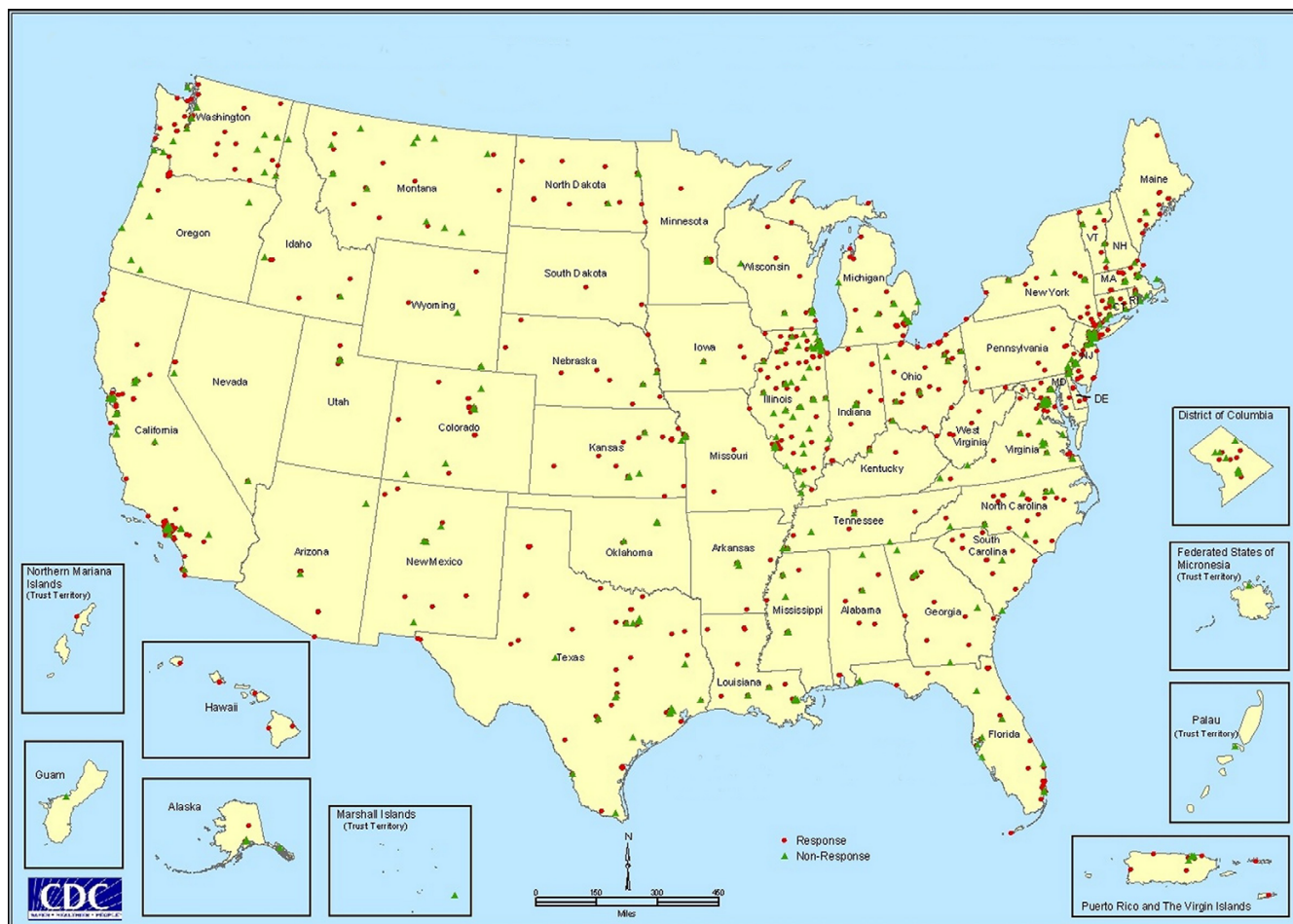
Figure 1 CBO response to HIV prevention service area survey. This map shows the location of all CBOs that received CDC funding for HIV prevention services in 2000. CBOs that responded are shown in red; green triangles indicate a non-response.

quality. Many HIV prevention programs do not collect address information; consequently, this approach was not feasible.