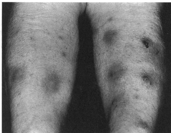
Figure 1. Multiple inflammatory nodules on the legs

Panniculitis has been associated with both polyarthropathy and a wide range of pancreatic disorders 1 . Although resolution of panniculitis can occur with control of the