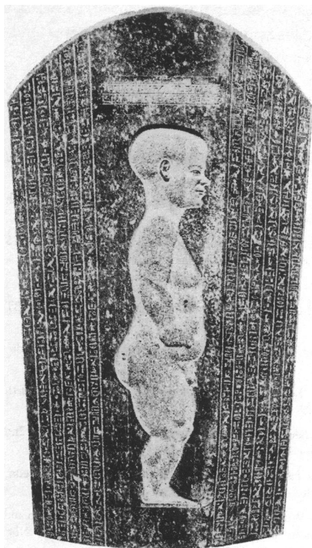
Figure 3 Achondroplastic on the sarcophagus of Djehor, Late period

likely a result of the genetic stagnation due to the consanguineous practices of the Royal court.