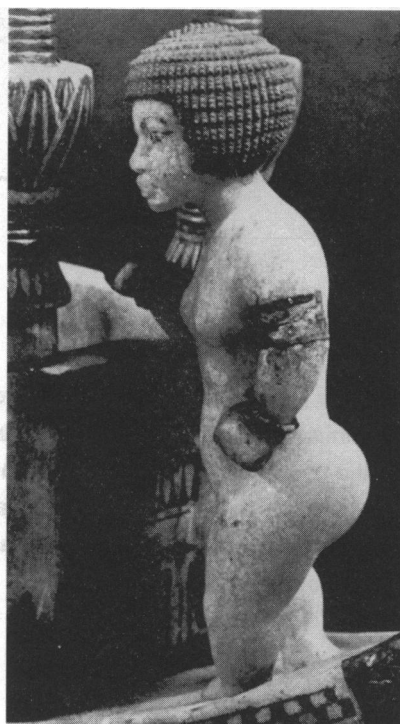
Figure 2 An achondroplastic female dwarf from the tomb of Tutankamen

Doctors were also very much specialized. A certain Sekhetnankh 21 was described as the 'nose doctor' to Sahure (V Dyn; see Appendix) and a limestone bas relief of Iry (IV Dyn), a royal physician, shows him to be 'guardian of the royal bowel movement' 22 . Specific deities were also associated with medical specialization: Duaw (eye diseases); Taurt and Hathor (childbirth and its complications); Sekhmet (pestilence, probably infectious diseases); and Horus (snakebites, probably toxicology). Deities were also associated with specific organs: Isis (liver);