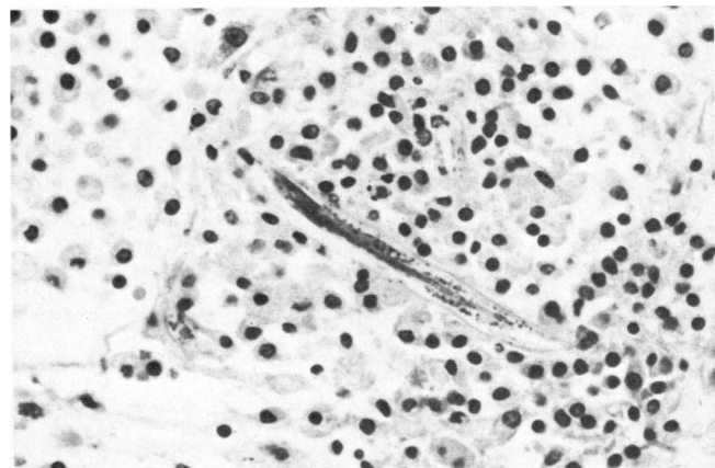
Figure 2.—A photomicrograph of duodenal tissue shows adult Strongyloides stercoralis in areas of necrosis (reduced from magnification \times 100 ).

(Yee A, Boylen CT, Noguchi T, et al: Fatal Strongyloides stercoralis infection in a patient receiving corticosteroids for obstructive airways disease. West J Med 1987 Mar; 146:363-364)