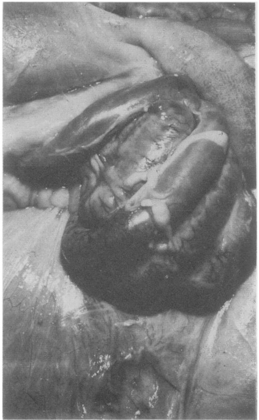
Fig. 1. Colitis in kid infected four days previously with 600 larvae of P. tenuis .

nodes were 2-3 times normal size and oedematous; nodes near the ileo-caecal valve were reddish. The ileum was oedematous with subserosal petechial and ecchymotic haemorrhages prominent over an area 10 cm in length about 40 cm from the ileo-caecal valve. The mucosa of the ileum was dark red in several localized areas 1-5 cm in length. Subserosal petechiae were present on the caecum. Part of the mucosa of the caecum near the ileo-caecal valve was dark red. The peritoneal cavity of kid 4 contained a large amount of straw-coloured fluid and fibrin. Mesenteric lymph nodes were oedematous and swollen 3-4 times their normal size. A dark red area, about 3 cm in length, was seen in the duodenum about 30 cm distal to the pylorus. The intestinal mucosa was congested. A dark red area, about 5 cm in length, was seen in the ileum about 40 cm from the ileo-caecal valve. The spiral colon was dilated, flaccid, and greenish in colour (Fig. 1). The mucosa of the colon was dark red and covered by a membrane in certain localized areas.