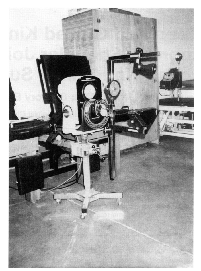
Figure 1. A flexometer was attached to the arm of the Cybex to determine the angle of shoulder rotation.

Before the training program began, we pretested all subjects for active and passive joint reposition sense. We positioned the subjects supine on the Upper Body Exercise Table with the shoulder joint axis aligned with the axis of rotation of the Cybex. Each subject's upper extremity was placed in 90° of elbow flexion, 90° of shoulder abduction, and neutral rotation. We applied an elastic wrap to each subject's hand to minimize tactile sensation from the lever arm of the Cybex. The orders of the active and passive testing and the angles of reproduction were counterbalanced. For the passive joint reposition test, we instructed subjects to relax while the shoulder was moved by the experimenter to one of the 3 predetermined angles and held for a total of 10 seconds. Once the shoulder was returned to the neutral position, the subject's shoulder was passively repositioned to the test position. We instructed the subjects to say "stop" when they sensed the test position was replicated. The angle at which this occurred was recorded and subtracted from the initial, predetermined angle. This difference was termed the "error." The examiner performed all passive movements at the speed of 6^{\circ} \cdot \sec^{-1} , as measured by the Cybex II dynamometer. The procedure was repeated twice at the same angle, and an average of the absolute value of the 3 errors was used for statistical analysis. The remaining 2 angles were tested in the same manner. Active testing was performed using the same