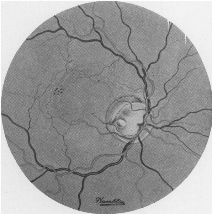
FIG. 3.—Fundus in 1940, showing hole in disk and mottling at the macula.

The patient then went abroad, and I did not see him again until 1940, seven years after the beginning of the trouble. Vision was then 6/5 (2) in the right eye and 6/5 full in the left, and the disk showed a typical hole. At the macula there was some faint disturbance with a little mottling, and a few dots of pigment (Fig. 3).