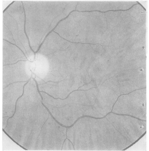
FIG. 1.—Left fundus of Case 2.

ocular findings in all five cases are described in detail below, and a summary of the appearances in individuals is given in Table I.