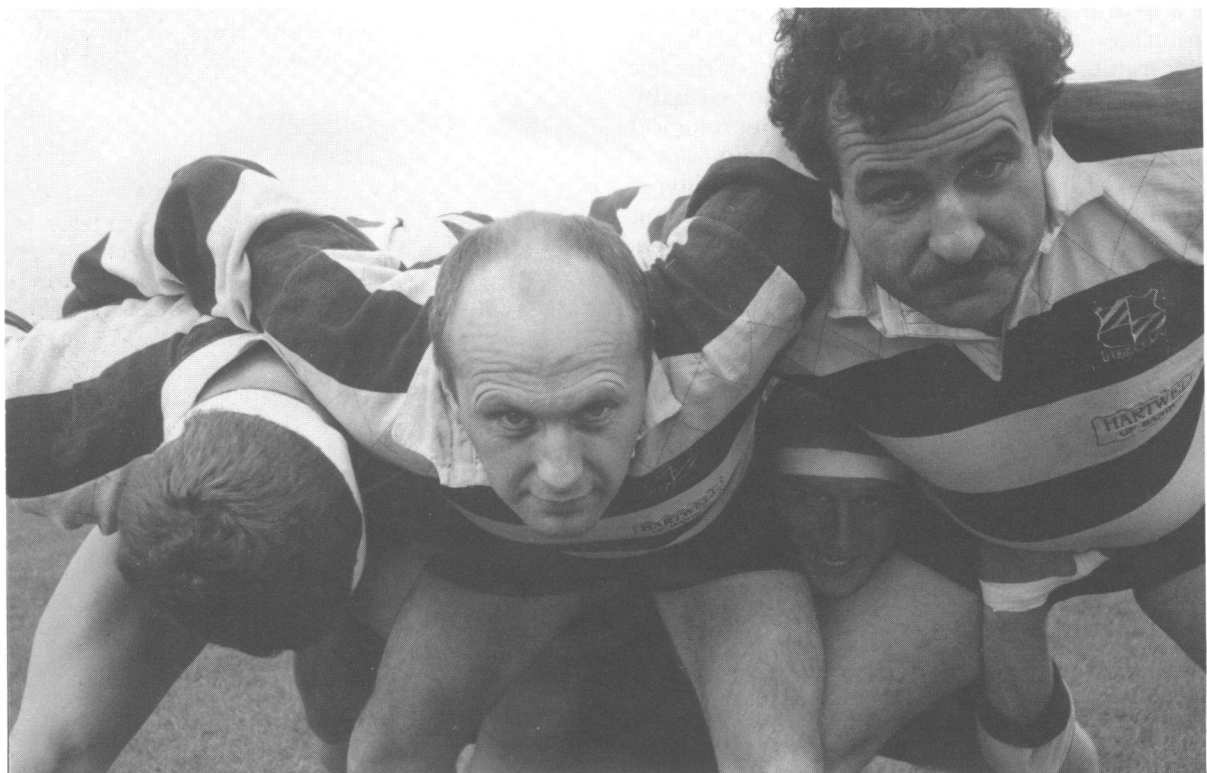
Figure 3. Rugby scrum