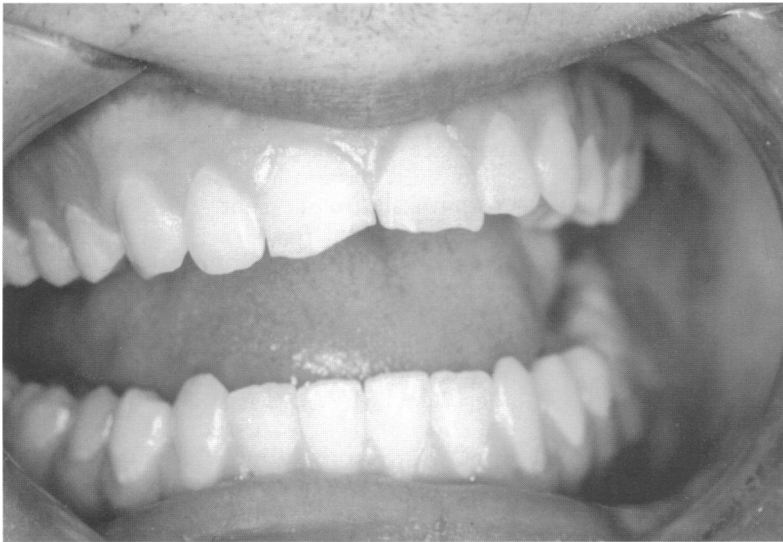
Figure 1 Labial view of upper front teeth. Note the loss of the incisal edges of the central incisors.