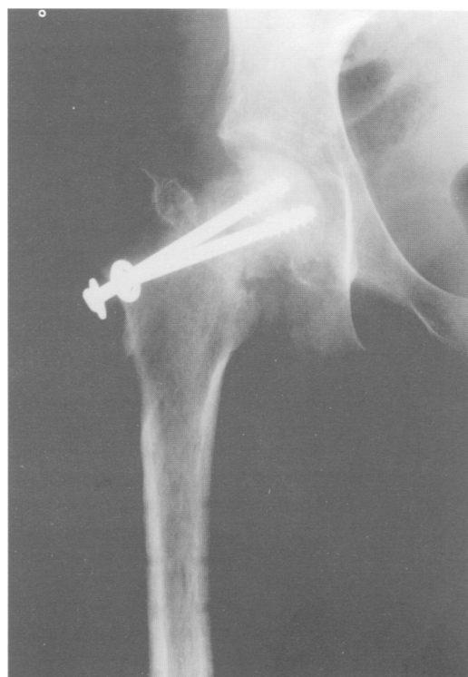
Figure 3 Revised fixation using cannulated screws and bone graft.

Once the diagnosis of a femoral neck stress fracture is made, established clinical algorithms can be followed. 5,11 Compression fractures can be managed with bed rest or