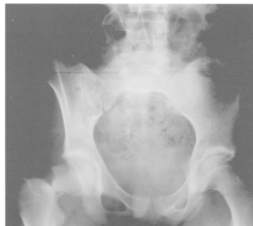
Figure 1 Anteroposterior radiograph of the pelvis showing a displaced compression type stress fracture of the right neck of femur.

Accepted for publication 29 October 1996