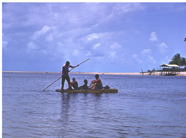
Figure 3 Seahorse fishers, Pernambuco State.

The prevailing view among interviewed fishers was that the female seahorse has the pouch (as expressed by some fishers, the "natural way"). Although that type of perception can sometimes be related to "machismo" [20], some fishers admitted that they were changing their opinion, because "a television program said that the male sea-