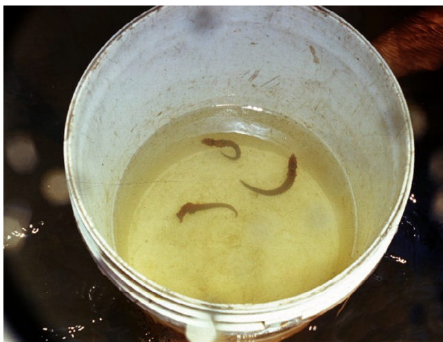
Figure 4 Type of container commonly used to keep the specimens of Hippocampus reidi harvested for the aquarium trade.