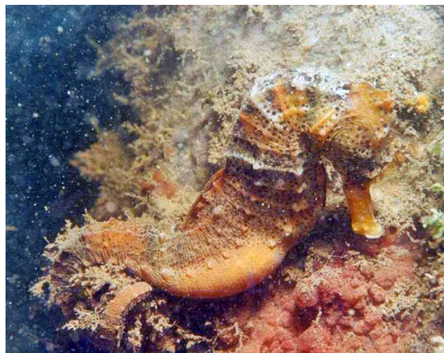
Figure 5 "Pregnant" male of Hippocampus reidi exhibiting ventral pouch.

tures of "pregnant" seahorses have also been recorded in other parts of Brazil [16]. As an exporter country, Brazil has to comply to the listing of seahorses in appendix II of CITES, and demonstrate that captures of seahorses are non-detrimental to wild populations. Therefore, feasible management options addressing the capture of brooding seahorses should be sought after in the country.