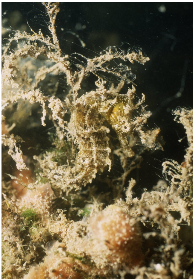
Figure 2 Camouflaged Hippocampus reidi , showing skin appendages.

from females by the presence of a ventral pouch in the former. 120 (81.6%) associated the presence of the ventral pouch with the female seahorse – "females have the pouch, they are the ones that carries the embryos – the natural way". Among the intentional fishers ( n = 36 ), 15 (41.6%) associate the presence of the ventral pouch with the female seahorse, 19 (52.7%) associated it with the male seahorse. Two fishers did not answer the question. Among occasional fishers ( n = 145 ), 105 (72.4%) associated the presence of the pouch with the females, while only eight (5.5%) associated it with the male seahorse. A total of 32 occasional fishers (22.1%) did not provide information on the topic.