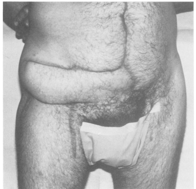
FIG. 3. The patient had good wound healing without infection, herniation or mesh extrusion.

While mesh extrusion has been previously documented after coverage by split-thickness skin, 1,6 it occurs uncommonly with the use of mesh in elective hernia repair. 11 The well-perfused cushion of overlying skin and subcutaneous tissue in elective hernia repair appears less vulnerable to erosion than the split-thickness skin with "filtered" blood supply through the mesh. Based on our dismal long-term results with the use of split-thickness skin grafts, we do not recommend that they be used over mesh. Although our experience with full-thickness coverage is small, it has been uniformly successful. Full-thickness, well-perfused tissue mobilized from either adjacent abdominal wall or from flaps from the thigh or dorsal surface,