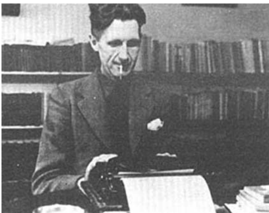
Figure 2 George Orwell smoking