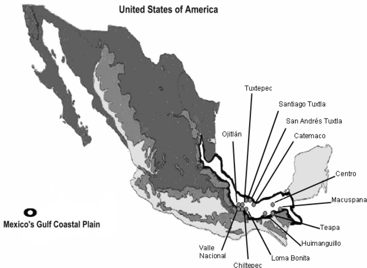
Figure 1 Mexican Gulf coastal plane and studied sites location. Modified from Rzedowski (1981).

knowledge in patterns of mushroom consumption and use.