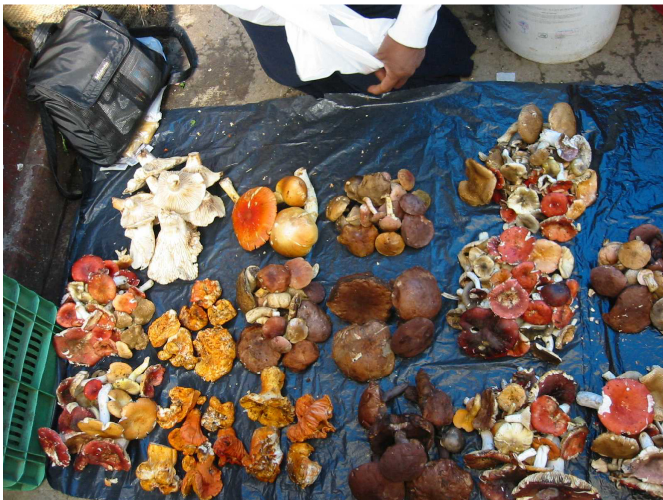
Figure 4 Typical wild mushroom stand in Temperate Mexico.

not sold) all sellers were mestizos. Moreover, Veracruz sellers had a limited environmental knowledge given their recent history as immigrants and colonizers.