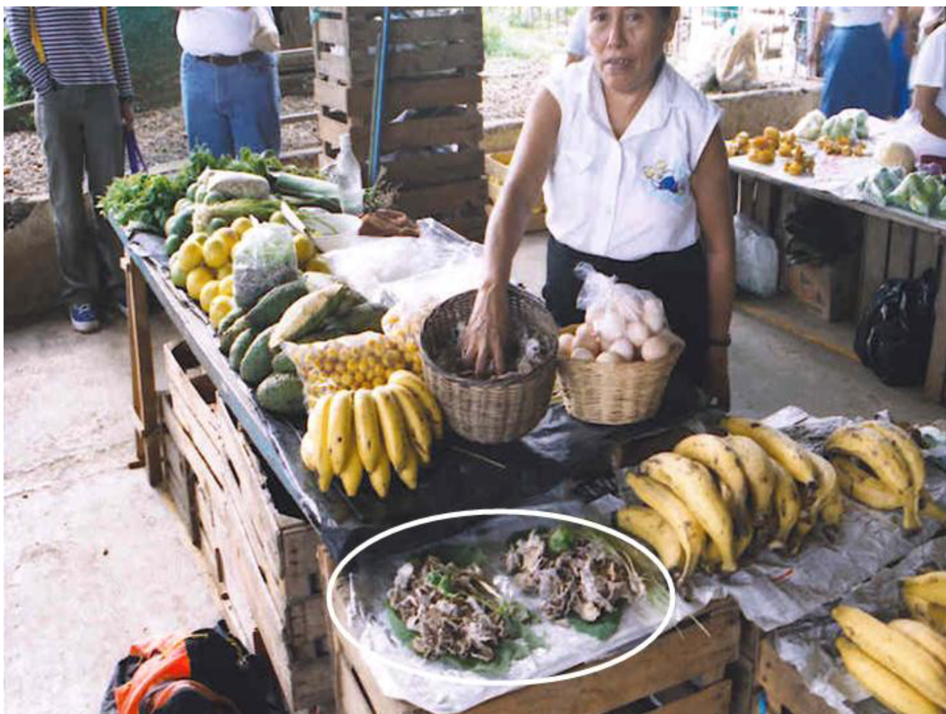
Figure 3 Typical wild mushroom stand in Mexican tropics, mushroom are signaled by an ellipse.