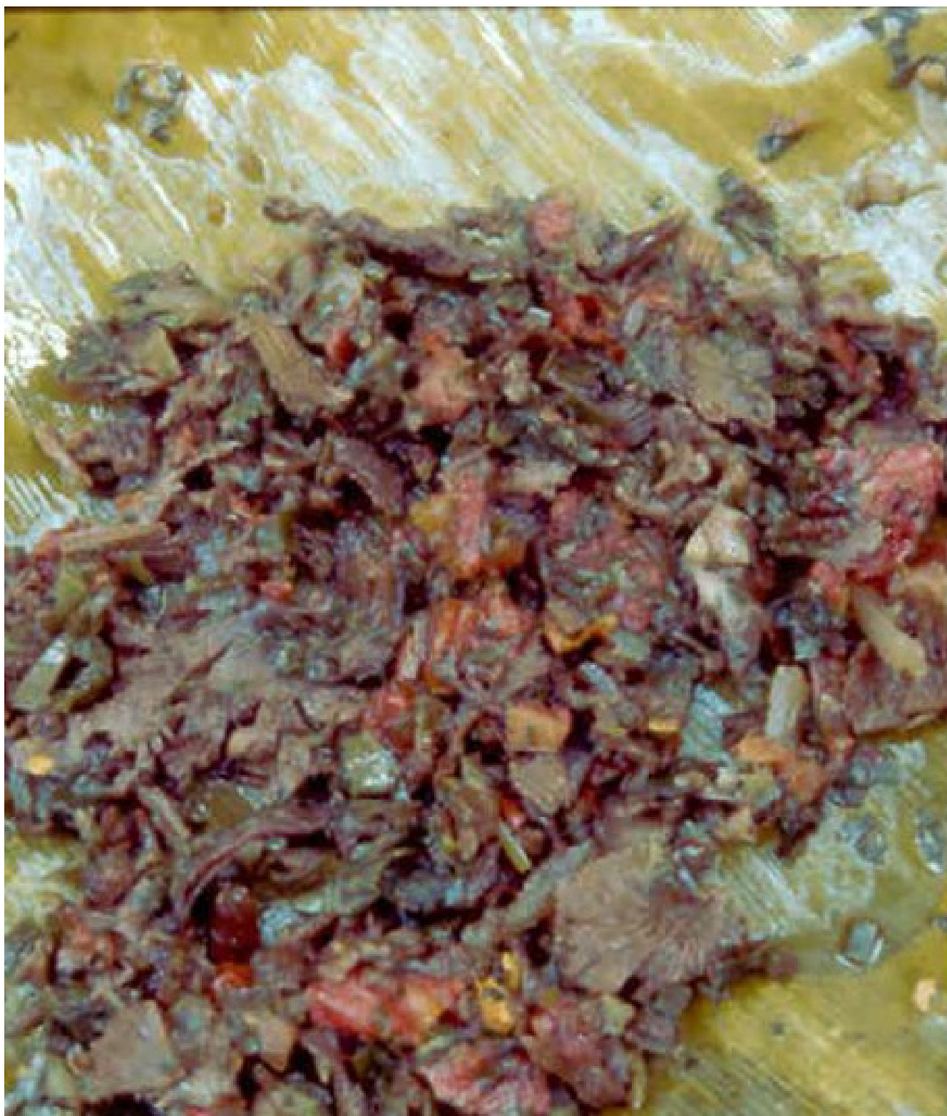
Figure 5 "Mone" a traditional meal made with mushrooms.