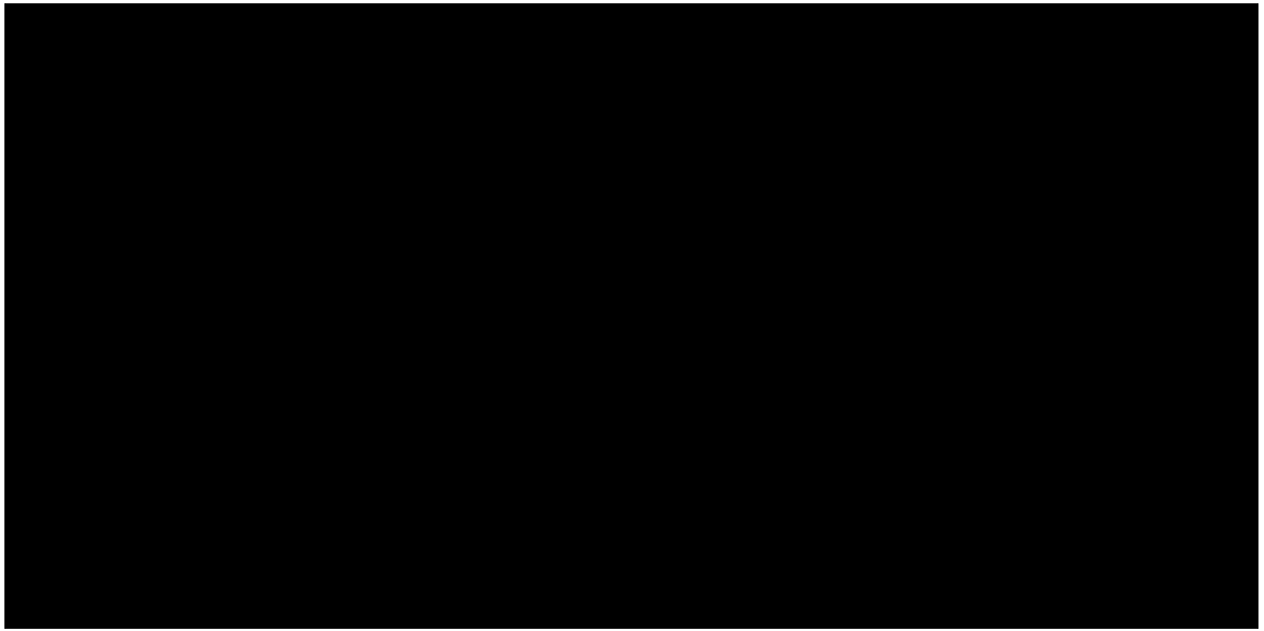
Figure 1. Schema showing distribution of the 2,155 participants who had been randomized to drug, metformin (MET), or placebo (PLC). Of the 1,274 participants completing the washout study, 78 were found to meet criteria for diabetes on the washout OGTT.