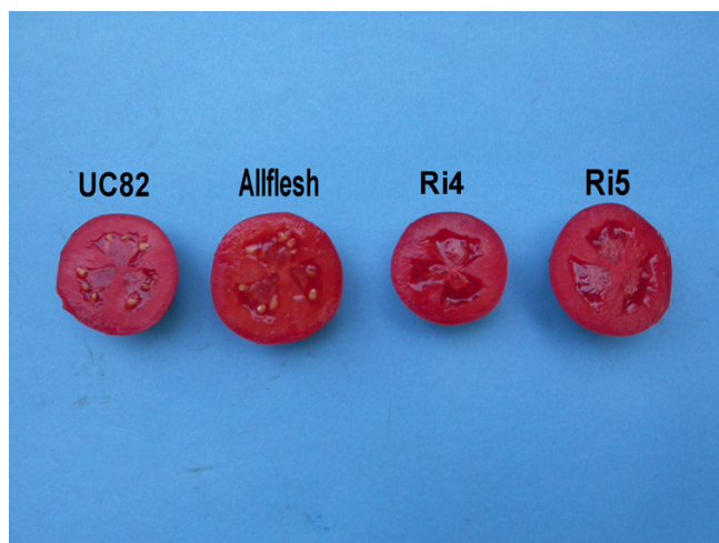
Figure 2 Cut tomato fruits of the four genotypes used: UC 82, Allflesh and GM UC 82 lines Ri4 and Ri5. GM fruits (Ri4 and Ri5) are seedless. UC 82 and Allflesh fruits contain seeds.

The open field trial of two transgenic tomato lines obtained from the processing cultivar UC 82 showed that the DefH9-R1-iaaM gene was able to induce parthenocarpic fruit development under open field cultivation conditions. Most (approximately 75%) of the fruits produced