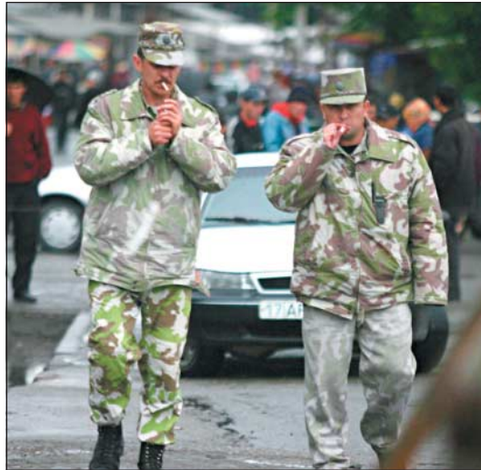
Helping BAT achieve its targets

BAT's plans projected a 45% increase in annual cigarette consumption between 1993 and 1999. 14,15 The increased supply of cigarettes, assisted by an exclusive arrangement with the state distributor, would be a key driver of market expansion alongside population and economic growth. 13-18 BAT expected a "growth in incidence among women as cultural stigma