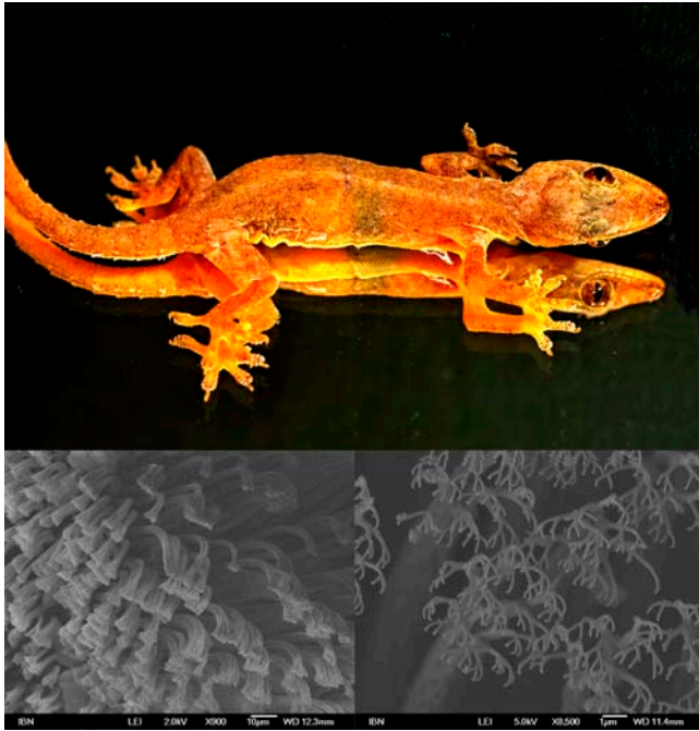
FIGURE 1 Images of spiny-tailed house gecko and its seta. (Top) A close-up photograph of the gecko on a glass-covered mirror used in this study. At the bottom are scanning electron microscope images of gecko setae showing the tree-like structure with a magnification of 900 times (left) and 8500 times (right).

surface simultaneously. In such a case, the measured adhesion force would be significantly stronger. More than 50 measurements were carried out in each experiment and the measured adhesion forces are plotted in a histogram (see Fig. 2, insets) to find the most probable value, distinguishing multispatula adhesion results from the more frequent single spatula event. The measured adhesion force for a single spatula can be deduced by this analysis although there are hundreds of spatulas on each seta.