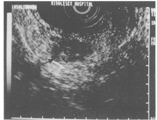
Figure 3: Well circumscribed insulinoma (arrowed) in the tail of the pancreas showing a complex internal low level echo pattern.

than the uncinate lobe and could not be found at subsequent laparotomy performed before endoscopic ultrasound.