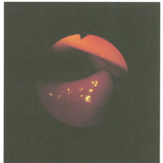
Figure 2: 'Tent roof' phenomenon that can occur during the direct stab approach of inserting gastrostomy tubes externally through the abdominal wall.

A number of different retainer systems are used including balloons, buttons or spirals. 19 20 The spiral retainer system is open to criticism on grounds of safety 21 possibly because of its length and rigidity.