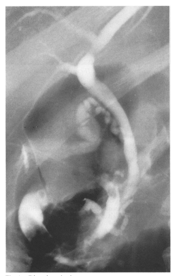
Fig. 1 Film of result of two separate injections at major papilla during ERCP.

Physical examination, routine biochemistry and serum amylase were normal. Plain abdominal films revealed speckled calcification in the pancreatic head region and a separate lateral calcified oval opacity. Ultrasound suggested chronic pancreatitis of the pancreatic head with calcification and an abnormal parenchymal echo pattern but the body and tail appeared normal and no pseudocyst was evident. Computed tomography (CT) scanning suggested some non-specific periduodenal thickening and con-