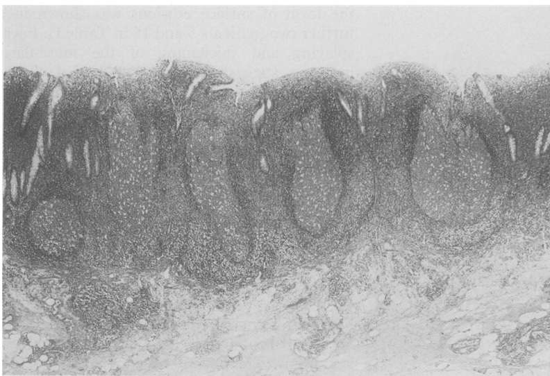
Figure 3: Rectal mucosa from patient 5 showing follicular proctitis. (Original magnification \times 22 .)

Inflammation occurring in excluded segments of large bowel was first recognised by Morson in 1972, 14 and subsequently labelled diversion colitis by Glotzer et al , 1 who causally related the inflammation to faecal diversion. Since then a number of case reports and small series have been published, describing the histological features mainly from biopsy material. 1-11 Only one previous report gave a detailed description of a resection specimen. 7 The histological features described previously include aphthoid